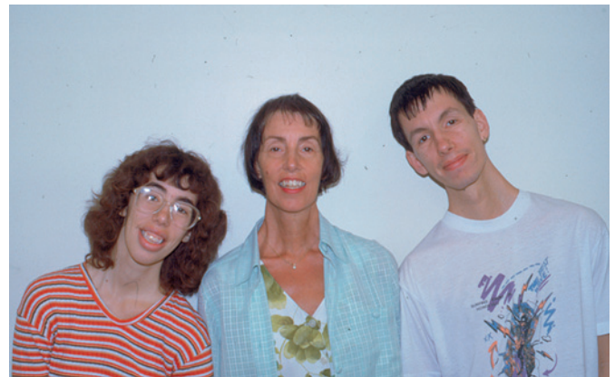
Figure 5 A mother with DM1 in centre (approximately 230 CTG repeats) with her affected daughter on the left (approximately 630 CTG repeats) and affected son (approximately 730 CTG repeats). The son and daughter have expanded repeats compared with their mother due to anticipation through the maternal line.

Myotonia may interfere with daily activities such as using tools, household equipment or doorknobs. Handgrip myotonia and strength may improve with repeated contractions—'warm up phenomenon'. 28 The warm up phenomenon can also improve