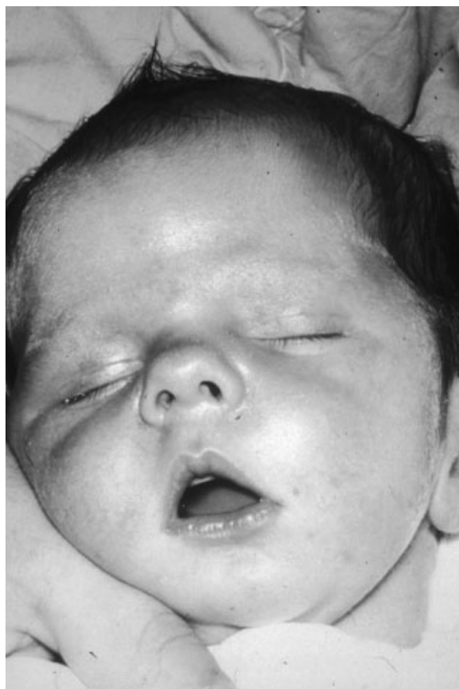
Figure 2 The typical tented upper lip ('carp mouth') appearance in congenital myotonic dystrophy.

The diagnosis of DM1 is made from DNA testing in an individual who is clinically suspected to have DM1. Non-molecular testing has been used in the past to establish the diagnosis of DM1 but now has no role in making the diagnosis in current practice. Patients may have had an EMG and occasionally a muscle biopsy and other tests before the diagnosis was clinically suspected. It is therefore valuable to be aware of the features of these investigations in patients with DM1. It should be emphasised that there is no clinical indication for performing a muscle biopsy to make the diagnosis of DM1. If the clinical features suggest DM1, but DM1 genetic testing is negative, then DM2 testing should be performed.