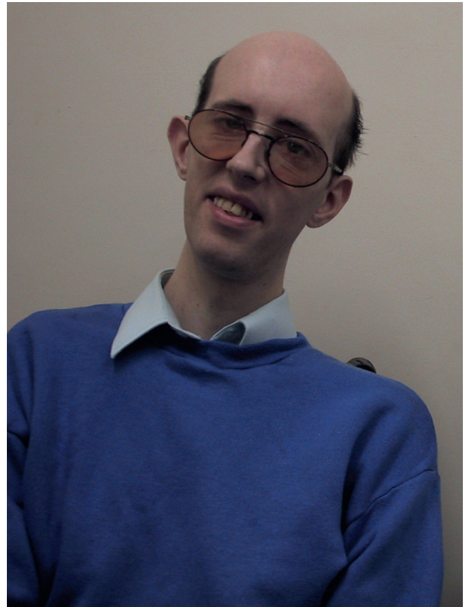
Figure 4 Patient is eldest son of patient in figure 3. He has congenital onset myotonic dystrophy and already shows similar features to his mother and frontal balding (approximately 1300 CTG repeats). Unfortunately, his younger brother (approximately 1500 CTG repeats) died suddenly and this was presumed to be secondary to a malignant cardiac arrhythmia.

The predominant symptom in classic DM 1 is distal muscle weakness, leading to difficulty with performing tasks requiring fine dexterity of the hands and foot drop, particularly affecting ankle dorsiflexors. The characteristic facies is caused by weakness and wasting of the facial, levator palpebrae and masticatory muscles giving rise to ptosis and the typical myopathic or 'hatchet' appearance (figures 3–5). The neck flexors and finger/wrist flexors are also commonly involved. Ophthalmoplegia is described but is rare. Muscle weakness progresses slowly. An axonal peripheral neuropathy may add to the weakness. 23